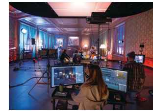
Studio V1: Virtual Production