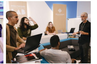
Full Sail University Healthcare Technology Lab powered by AdventHealth University