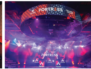
Full Sail University Orlando Health Fortress