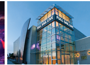
Full Sail Live Venue