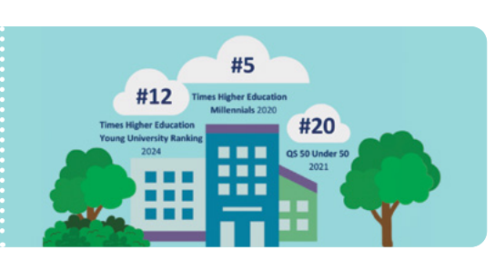
The University of Antwerp scores extremely well in Young University Rankings

As home away from home to over 20,000 students , the University of Antwerp prides itself on operating on a human scale. Our faculty and staff will welcome you into top-notch infrastructure on one of our four campuses. While you're here you are also invited to enjoy our vibrant cultural programme, sports facilities and many student services.