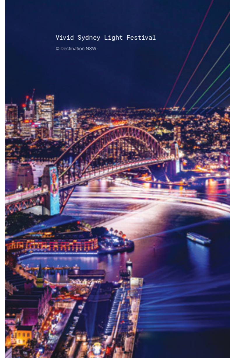
Vivid Sydney Light Festival

There are a variety of restaurants, shops, healthcare services and other amenities around the campus that will meet your everyday needs.